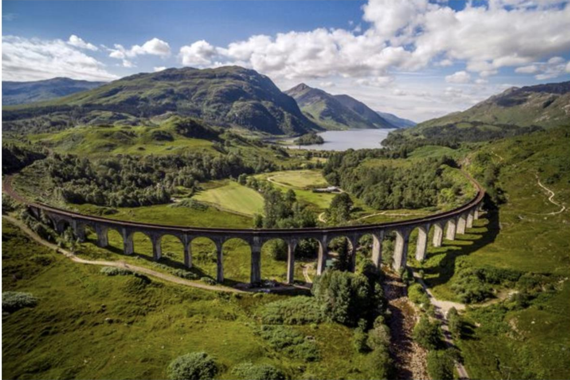
📍 Glenfinnan Viaduct on the West Highland Line features in the Harry Potter movies.

Harry Potter and The Deathly Hallows: Part 1 (2010) - iconic shots of the Hogwarts Express were filmed at the Glenfinnan Viaduct in the Highlands. Glenfinnan also features in the second and third Harry Potter books, Harry Potter and the Chambers of Secrets (2002) and Harry Potter and the Prisoner of Azkaban (2004).